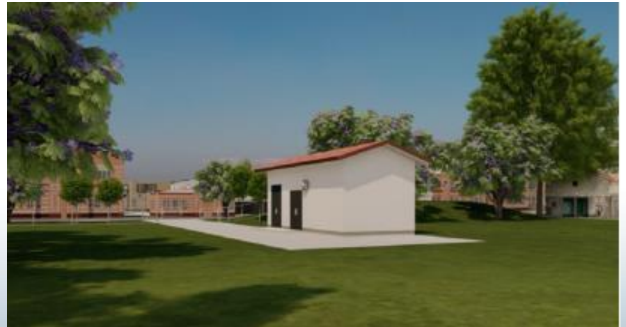
Site #1 Fenton Field