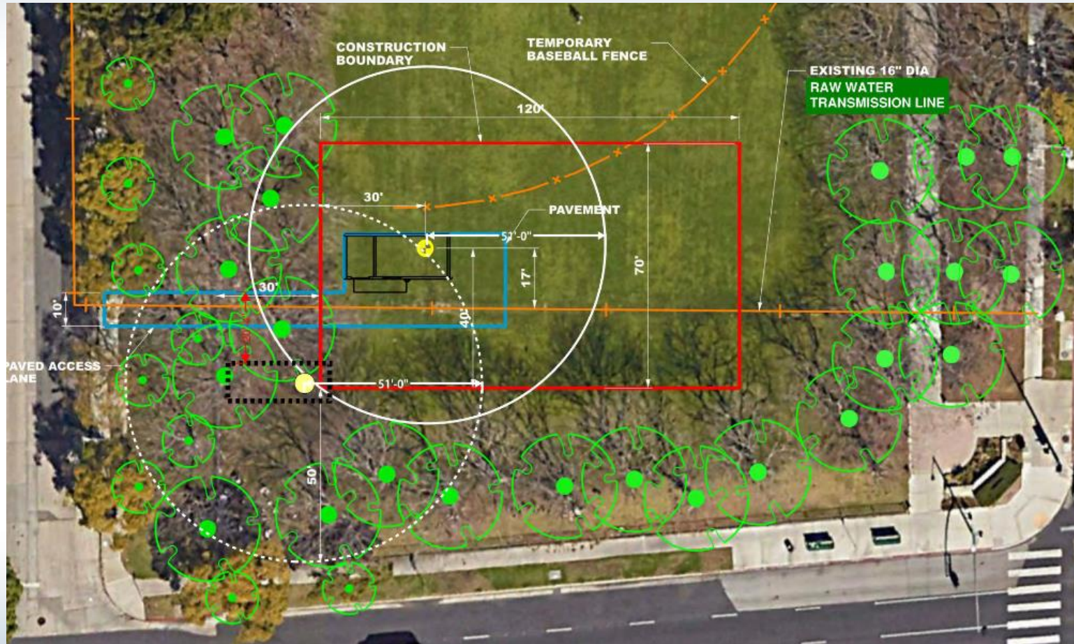
Site #1 Fenton Field