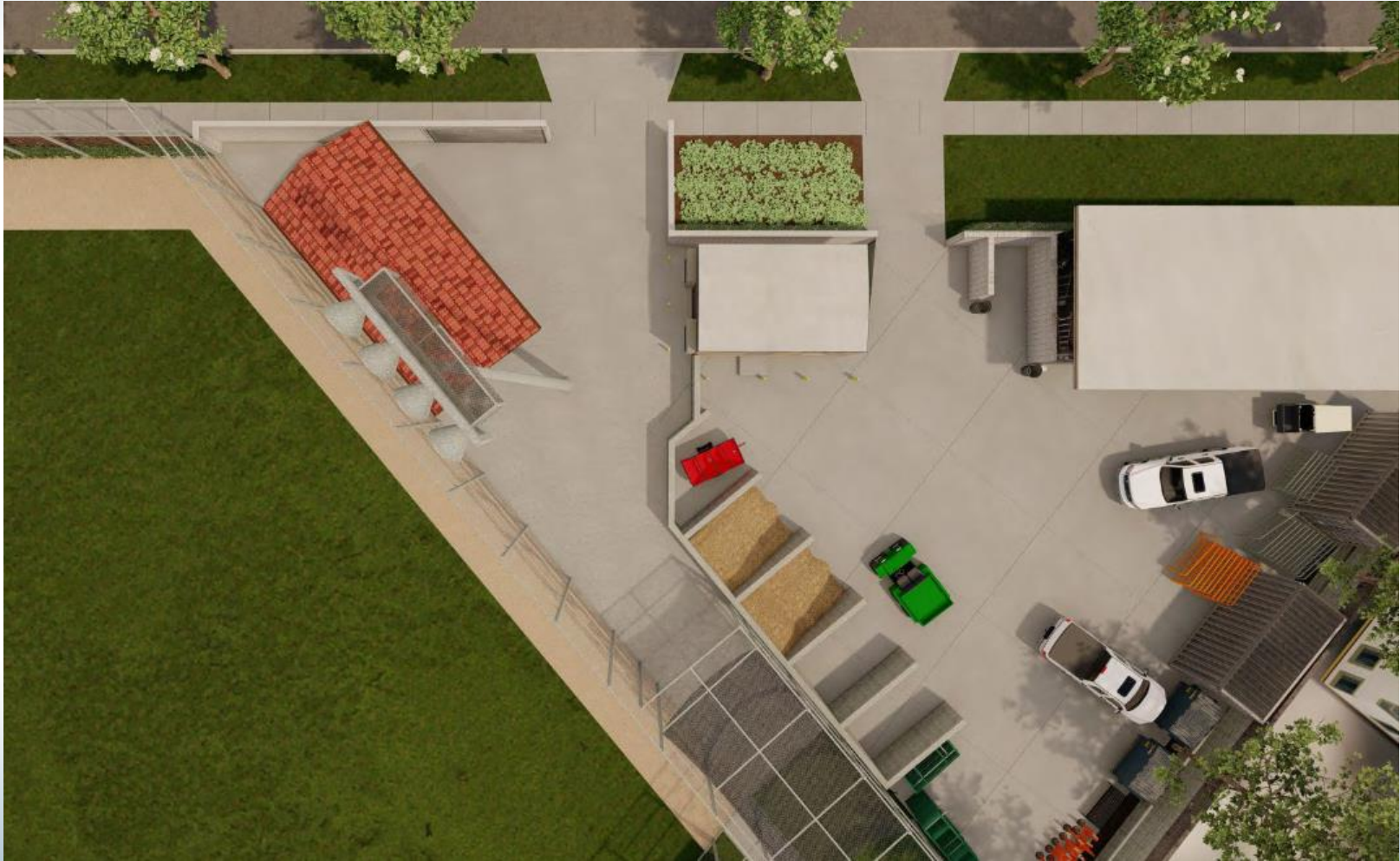
Site #2 Maintenance Yard