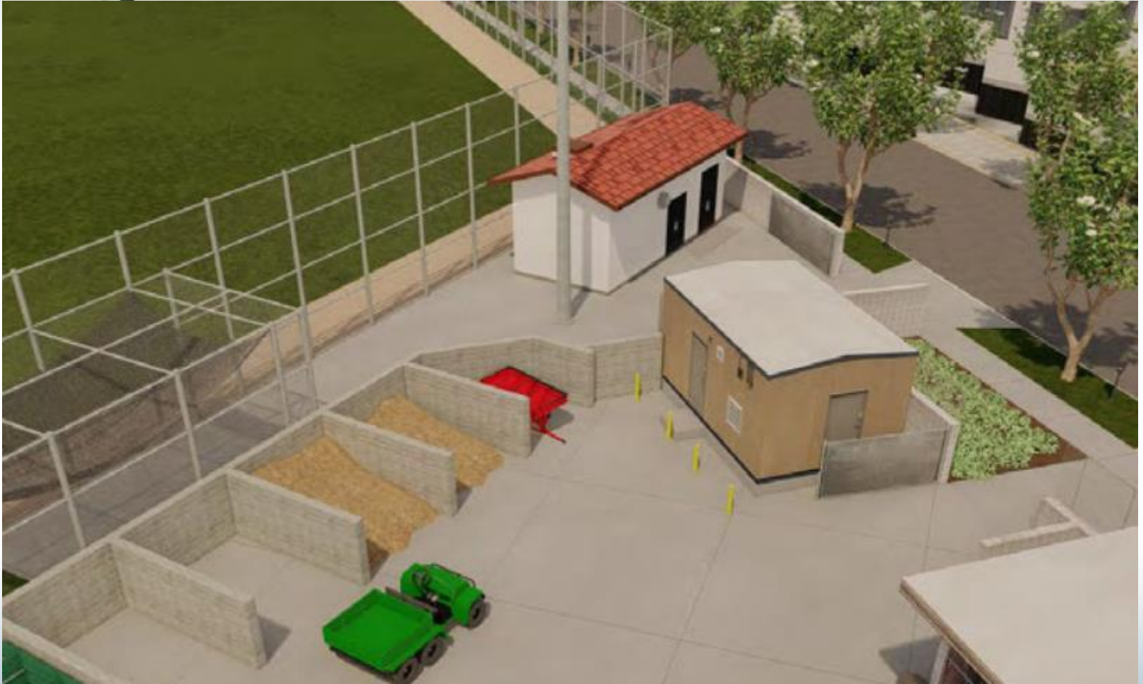
Site #2 Maintenance Yard