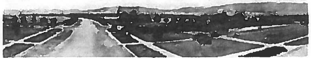
1915 panoramic photo